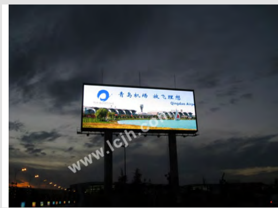
The biggest outd...