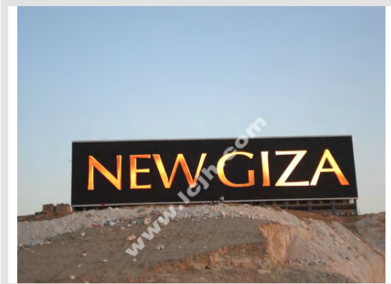
Top of the Seven...